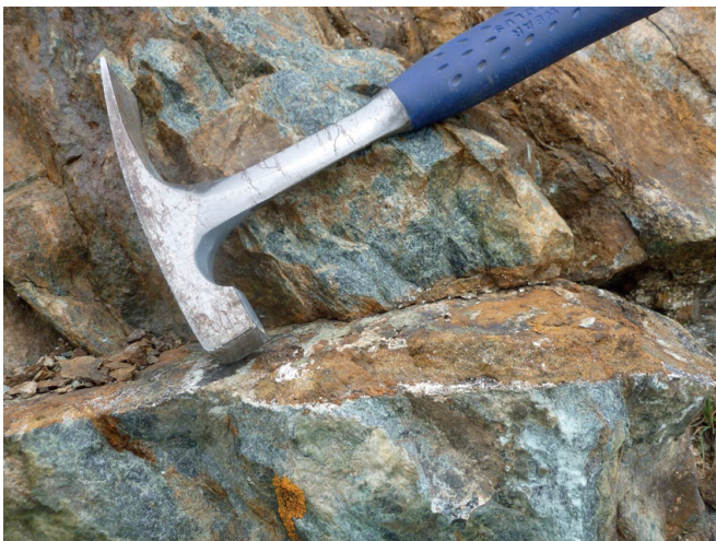
Figure 2. Olivine (brown) vein, almost without talc, in antigorite serpentinite (light green).